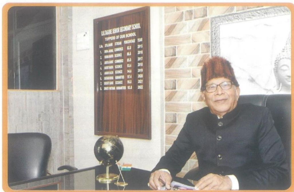
B.Sc. (Hons) M.Sc., Ph.D